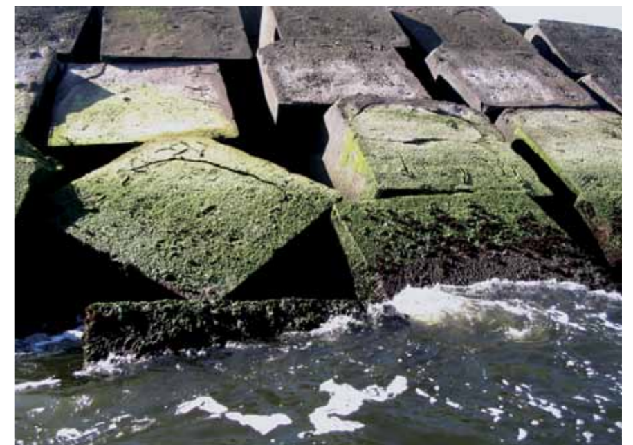
Photo above: armour stone with coarse grading. Photo below: armour stone with heavy grading.